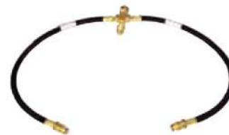
2001-S3 3 cylinder manifold