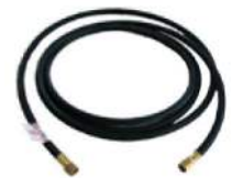
34180-4 15ft Hose Assembly