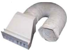
THCP-DD and THCP-WD12