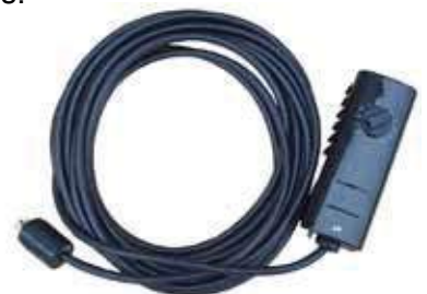
Remote Thermostat Control c/w 25ft Cord