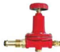
1230VK1 Fitted Regulator Kit