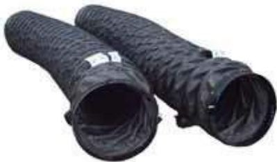
16" x 25ft Hitex Outlet Ducting 16" x 25ft Ventflex Inlet Ducting

Includes integrated fork lift pockets and lift points. Easy access to burner, fuel lines and electrical controls. Approved for indoor and outdoor installations.